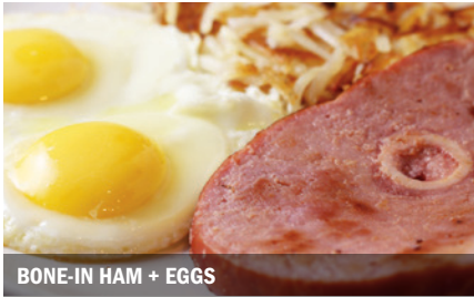
BONE-IN HAM + EGGS